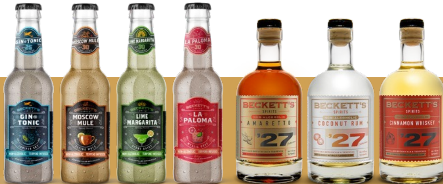
Beckett's™ Non-Alcoholic Gin & Tonic, Moscow Mule, Margarita, Paloma, Coconut Rum, Cinnamon Whiskey & Amaretto

Reformulation underway to reduce ingredient logistics simplify and support multi-jurisdictional sales and licensing