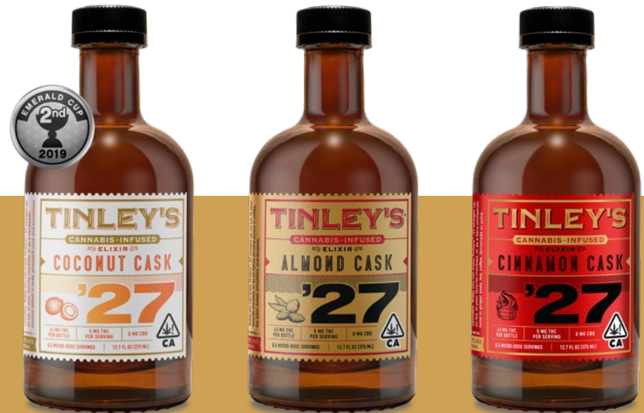
Tinley's™ '27 Shareable Multi-Serve Sippers & Mixers (5 mg per 1.5 fl oz shot, 8.5 shots/bottle)