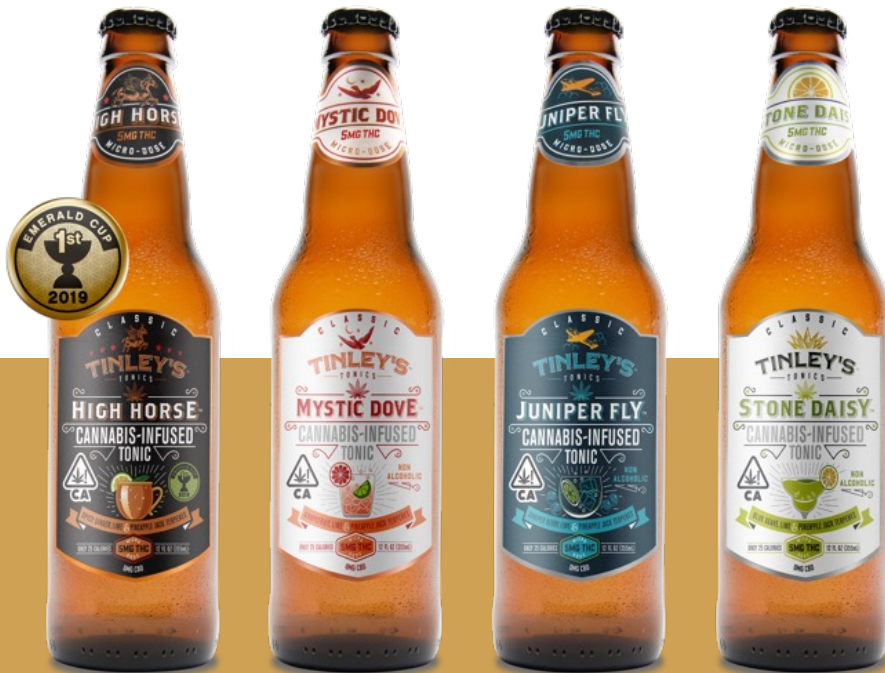
Tinley's™ Tonics Carbonated Ready-to-Drink Classics (5 mg/bottle)

1 st Place – Tinley's™ "High Horse" 2 nd Place – Tinley's™ "Coconut Cask"